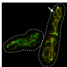
When coexpressed in fission yeast, FtsZ1 (green) and FtsZ2 (red) coassemble into a complex network of filaments and closed rings (arrow).

T erBush and Osteryoung explore how two cytoskeletal proteins combine to promote chloroplast division.