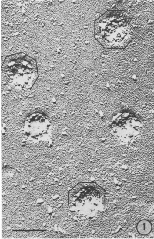
FIGURE 1 The inner nuclear membrane as seen from the nucleoplasm of a human melanoma cell line in vitro is exposed by the freeze-etching technique. The angularity of nuclear pores is indicated by black bars. Scale marker, 1000 Å. \times 150,000 .